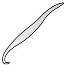
Hookworm (5x actual size)

Since the dog's environment can be infested with hookworm eggs and larvae, it may be necessary to treat with chemicals to remove them from your yard. We can offer recommendations for grass-friendly products.