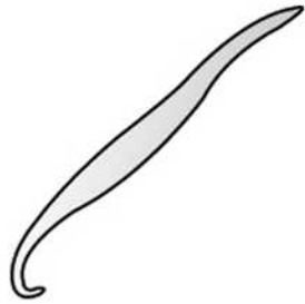
Hookworm (5x actual size)

Hookworms are intestinal parasites of the cat and dog. Their name is derived from the hook-like mouthparts they use to anchor to the lining of the intestinal wall. They are only about 1/8" (two to three mm) long and so small in diameter that they are barely visible to the naked eye.