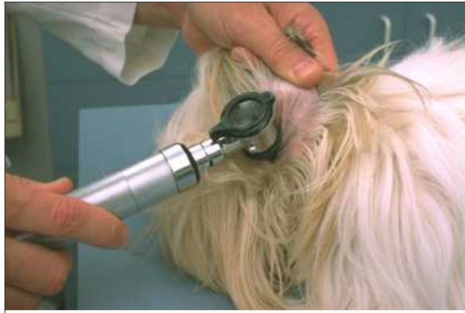
Otoscopic exam of ear canal.

An important part of the evaluation of the patient is the identification of underlying disease. Many dogs with chronic or recurrent ear infections have allergies or low thyroid function (hypothyroidism). If underlying disease is suspected, it must be diagnosed and treated or the pet will continue to experience chronic ear problems.